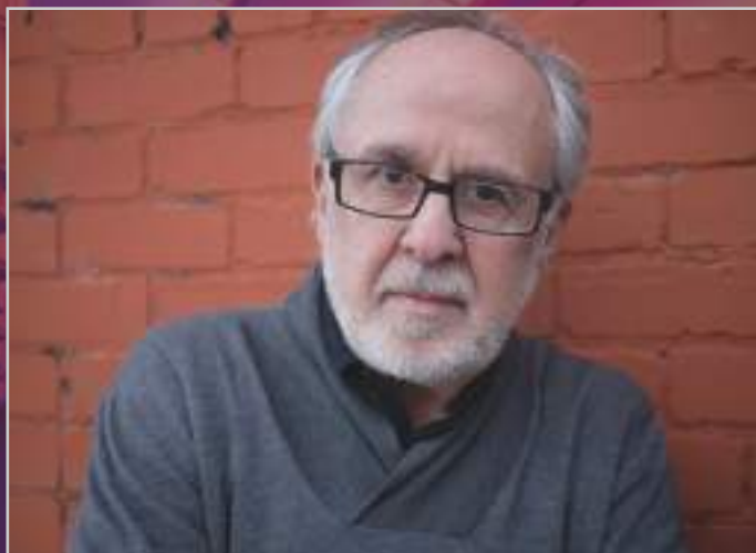
BOB JAMES FRIDAY, OCTOBER 26 • 7PM SATURDAY, OCTOBER 27 • 6PM & 8:30PM