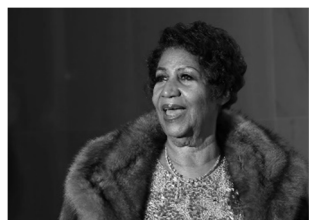
Aretha Franklin (1942-2018)

ARETHA FRANKLIN, ‘the queen of soul’, died on August 16, 2018. She was 76.