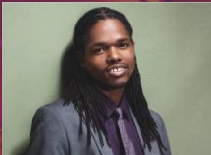
LANDAU EUGENE MURPHY JR SALUTES SINATRA AND THE MAGIC OF MOTOWN FRIDAY, OCTOBER 5 • 7PM SATURDAY, OCTOBER 6 • 7PM