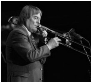
Bill Watrous (1939-2018)

Trombonist BILL WATROUS died on July 2, 2018. He was 79.