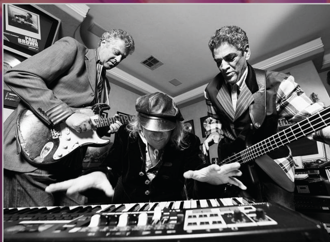
THE BROTHERS BROWN FRIDAY, OCTOBER 19 • 7PM SATURDAY, OCTOBER 20 • 7PM